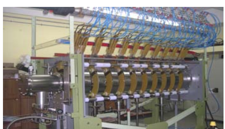
Future Research/Development Plan:

d) To protect the magnet coils of the MaPLE Device from overheating temperature of each coil is monitored electronically using temperature low cost sensor IC chips. Parallel port of PC is cleverly utilized for addressing 36 sensor chips.